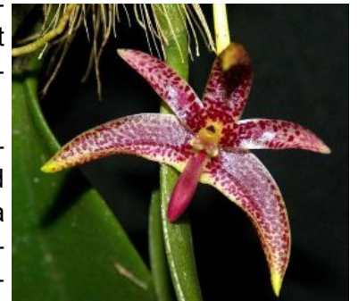
Bulb. patens