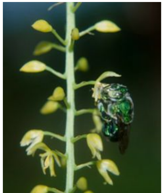
A male orchid bee collects fragrance compounds from flowers of a Notylia orchid. Female orchid bees choose mates based upon the mix of these chemical compounds.

http://blogs.smithsonianmag.com/science/