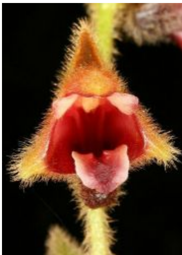
Trichotosia velutina