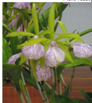
Anita Spencer's Bc. Binosa 'Wabash Valley' AM/AOS