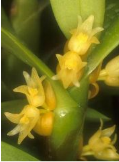
Eria biflora

ra as well.) Thus far she has visited Canada, Costa Rica, Panama, Ecuador, Peru, Brazil, Venezuela, Columbia, Mexico, Australia, China, Germany, France, Luxembourg, Greece, Rhodes, Crete and Borneo on orchid "field trips". Not forgetting the US, she has also traveled to various sites in California, Oregon, Pennsylvania, West Virginia and Virginia to see North American native orchids.